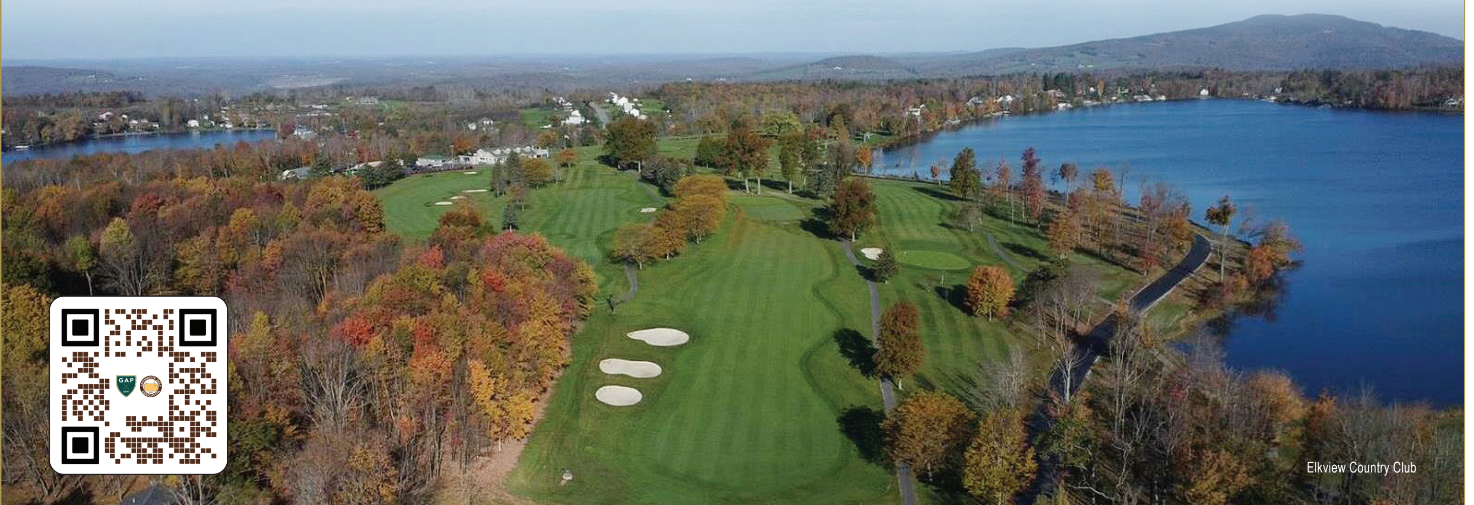
Elkview Country Club