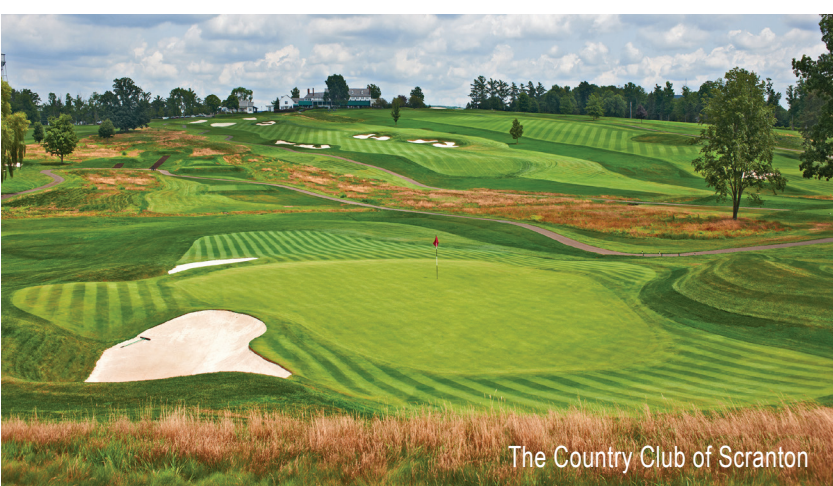
The Country Club of Scranton